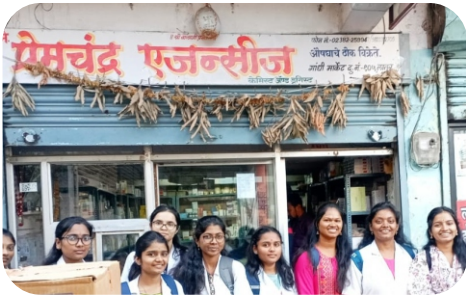
Field Visit taken to Community Pharmacy