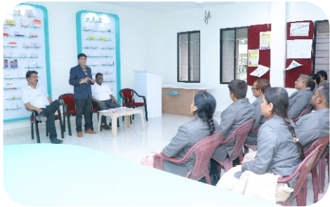
NAAC Peer Team Visit to Model Pharmacy Lab