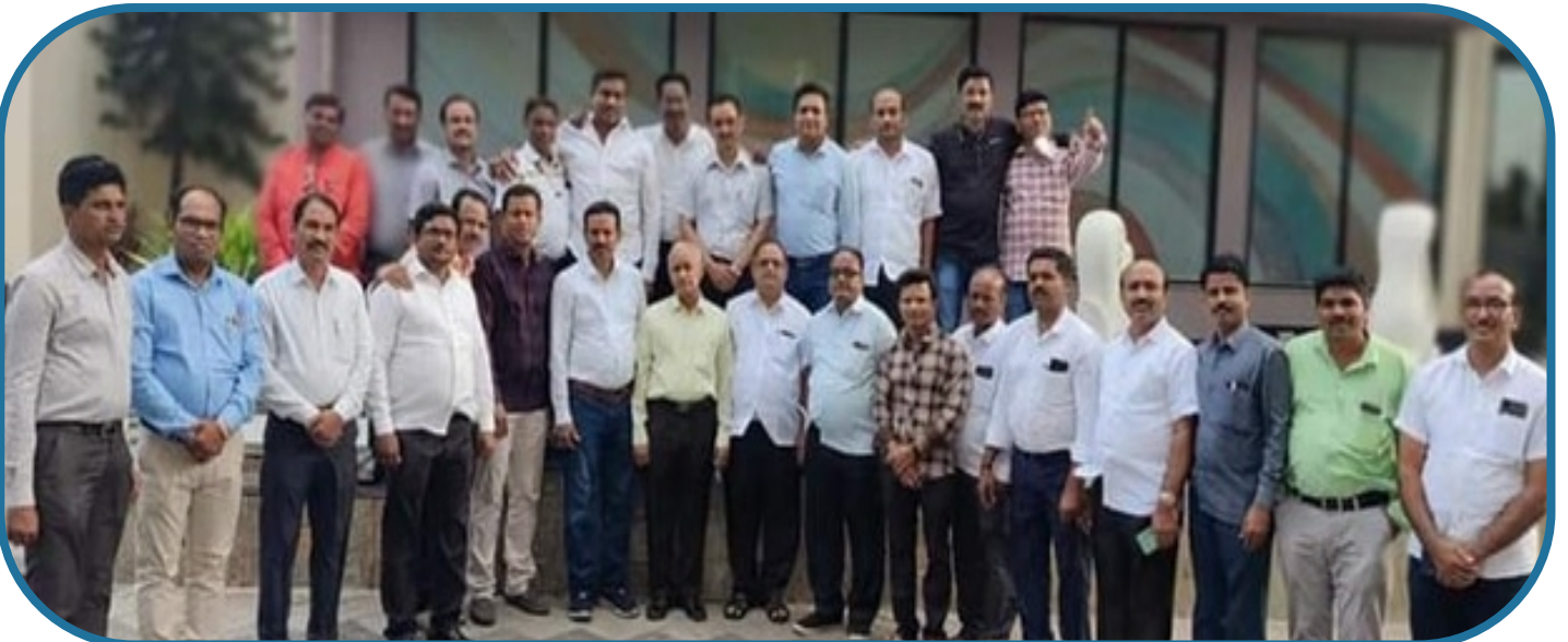
Alumni Meet Arranged at Hotel Aroma from Alumni of Batch 2003