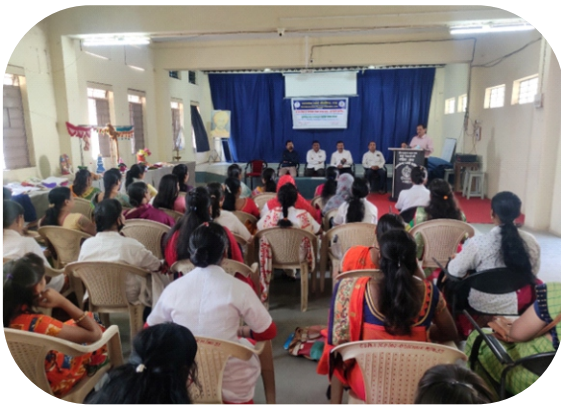
Certificate Distribution Program