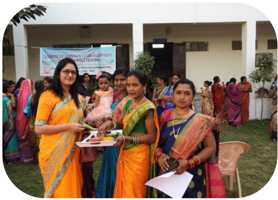
Annual Community Mahila Mela