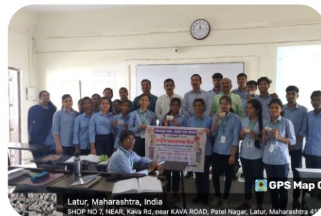
National De-Worming Day Celebration