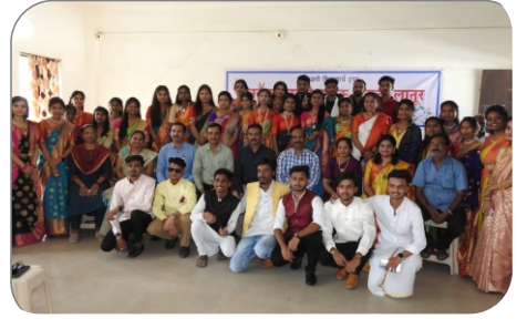
Group Photograph in Gathering