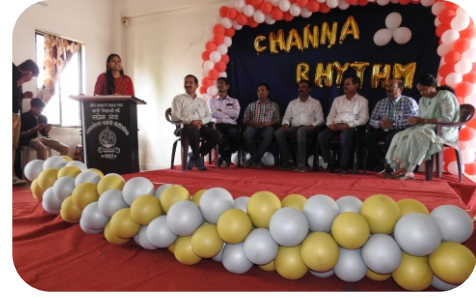
Inaugural ceremony of Annual Day "Channa Rhythm"