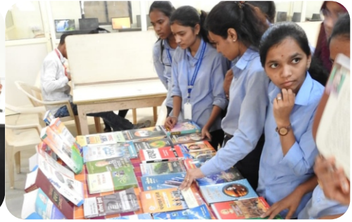
Glimpses of Marathi Bhashya Savardhan Pandharvada Celebration