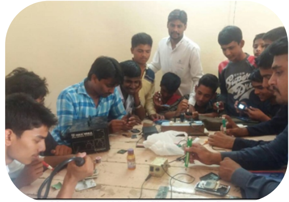
Training Program Main Centre Cellular Phone Repair