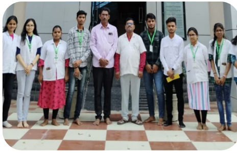
Visit to Gayatri Hospital at Latur