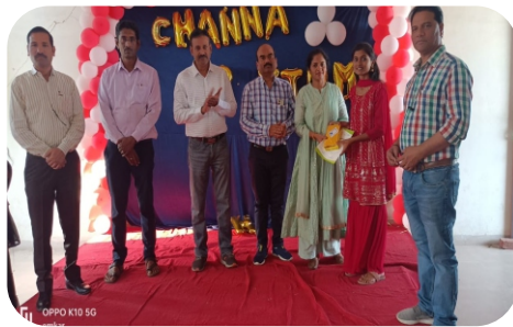
Annual Day Price Distribution