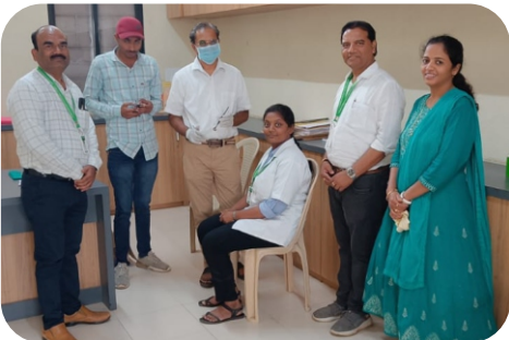
Dental Camp in collaboration with MIT Dental College, Latur