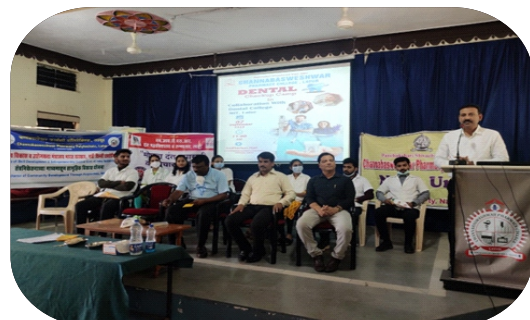
Free Dental Check up Camp organised by CDTP