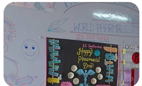
Class Decoratation by the Students