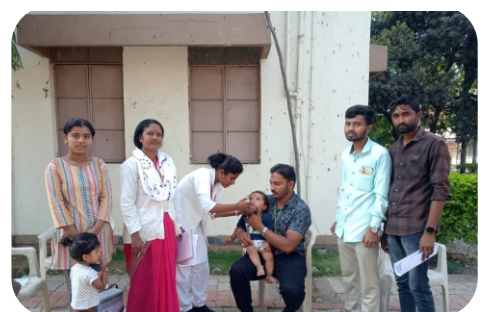
Pulse Polio Immunisation Program Camp