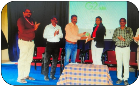
Awareness Programme of G2