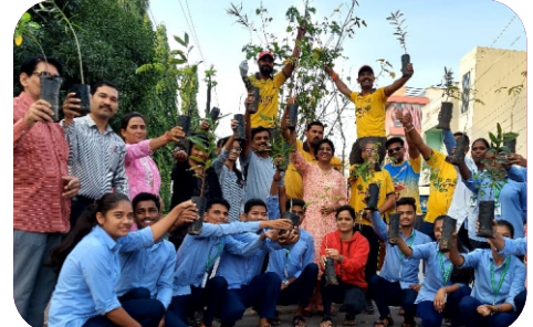
Tree Plantation in Association with Bar Council, Latur