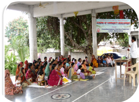
LPG and Safety Use Camp At Katpur