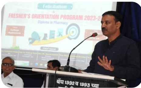
Orientation Program Organized for Freshers