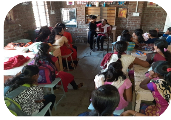
Advanced Training in Beauty Parlor, Hair Stylist and Make up