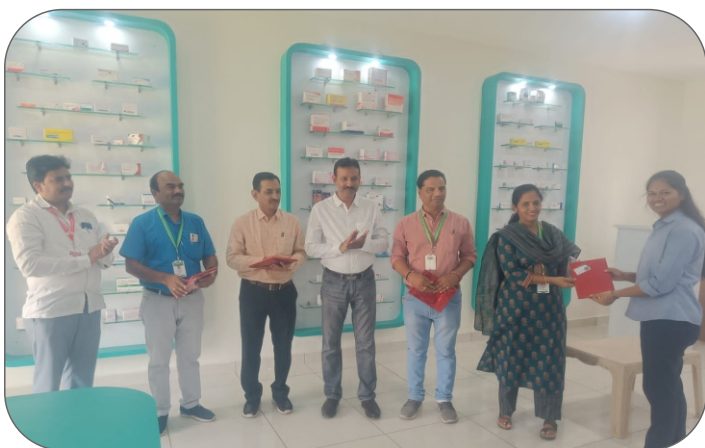
Contribution of Outgoing Students for New Model Pharmacy Lab