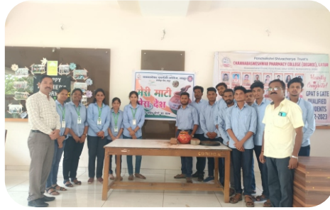
Mere Mathi Mera Desh Celebration