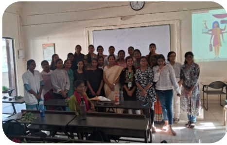
Womens Day Celebration