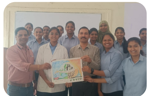
Poster Presentation on World Water Save Day