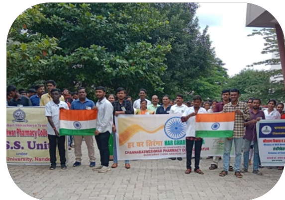
Involvement In Har Ghar Tiranga Abhiyan