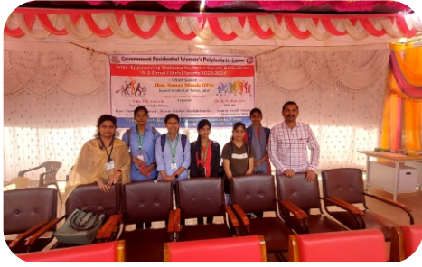
Participation in Sports of IEDSSA