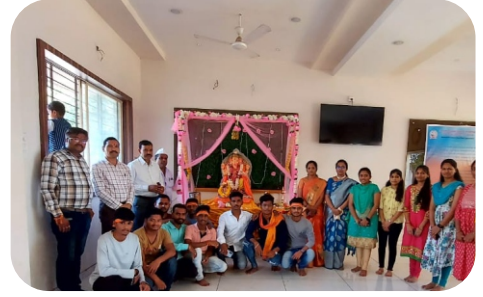
Ganesh Festival Celebration