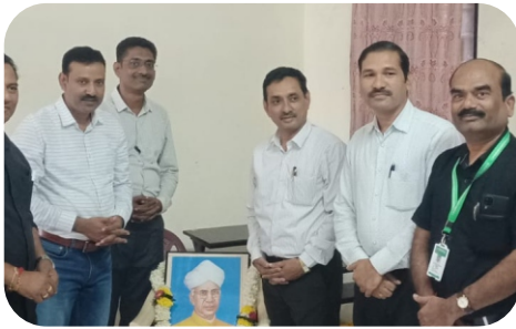
Teachers Day Celebration