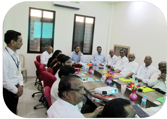
Annual Advisory Body Meeting Chairperson Hon. CEO, Zilla Parishad