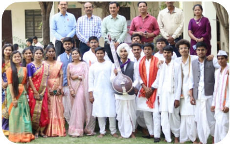
Cultural Dressing Day