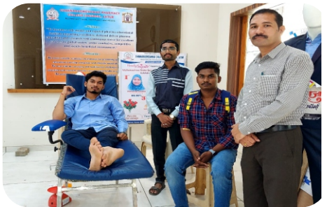
Blood Donation Camp on the Occasion Punyatithi of Channabasvaguru