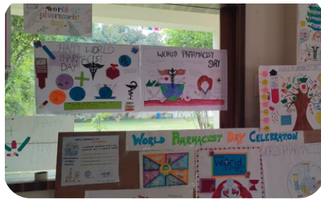
Poster Presentation on Pharmacy Strengthening Health System