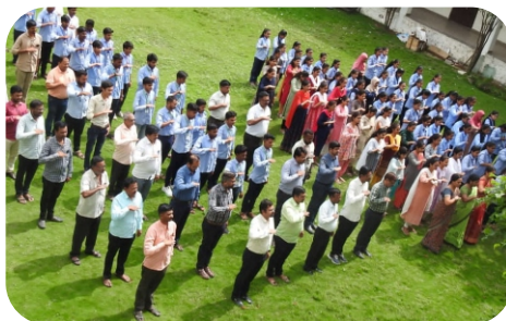
Reading Pharmacist Oath