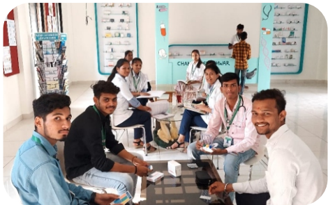
Conduct of Various Screening test Viz Blood Glucose Level, Blood Pressure Measurement Lung Function test in Model Pharmacy Lab