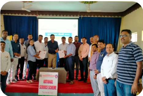
National Electoral Registration Camp by NSS Unit