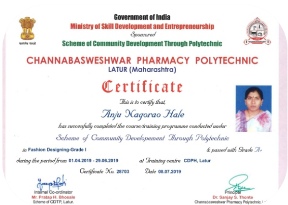
Training Programme Certificate