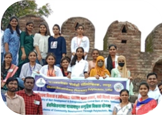
Visit of Trainee Students to Naldurg Fort