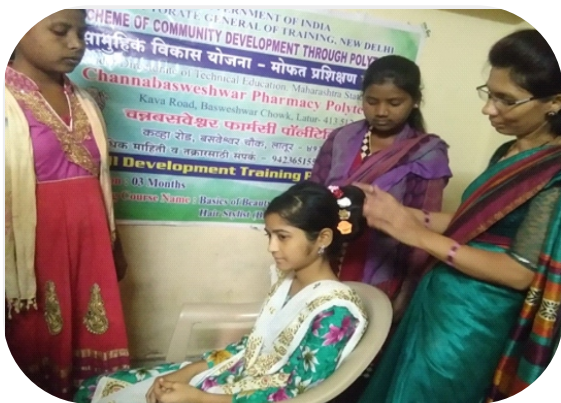
Basics in Beauty Parlor Training Program