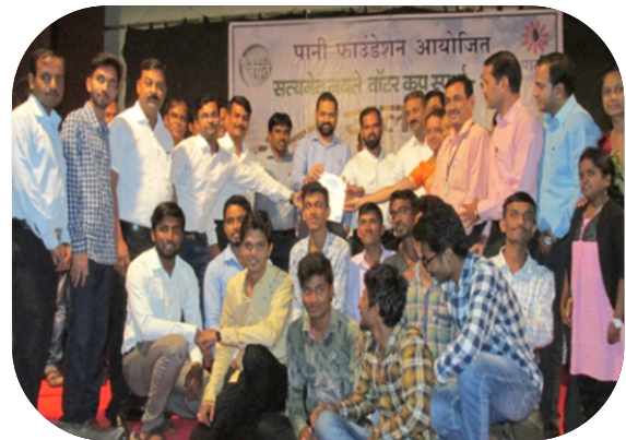
Appreciation of Social Work by Pani Foundation