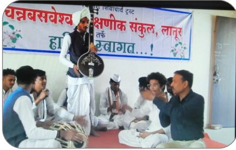
Cultural Event (Kirtan)