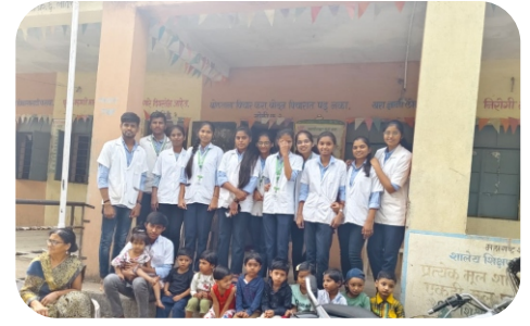
Visit to School