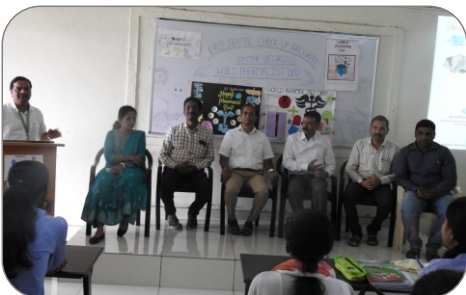
Dental Check up Camp