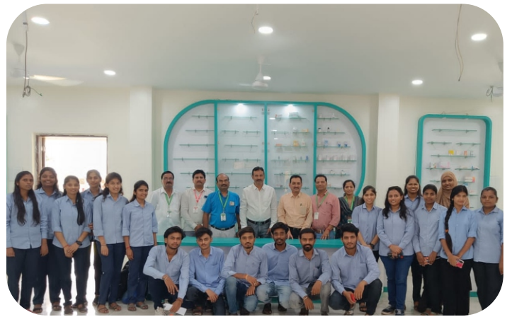
Model Pharmacy Lab with students of Batch 2022 to 24