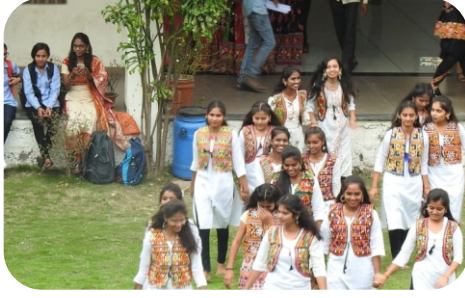
Dandiya Competition on Occasion of "Durga Pooja"