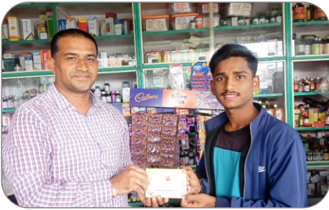
Best Wishes Card Distribution to the Pharmacist on the Occasion of World Pharmacist Day