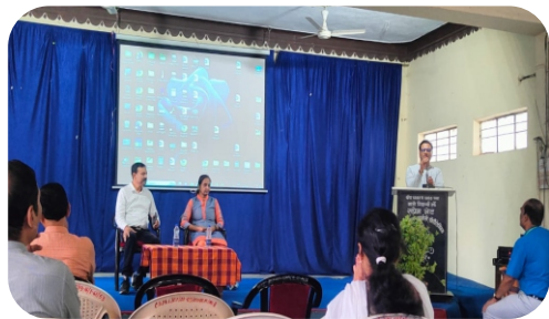
Lecture on Patient Counselling