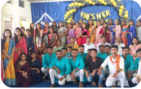
Freshers Party celebration