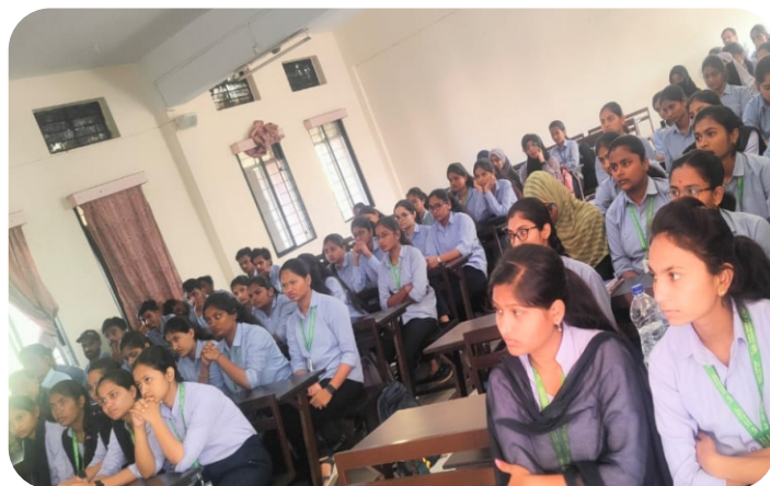
Finishing workshop on Nurturing the Future Pharmacist for out going students, of Pharmacy Institution of Vicinity