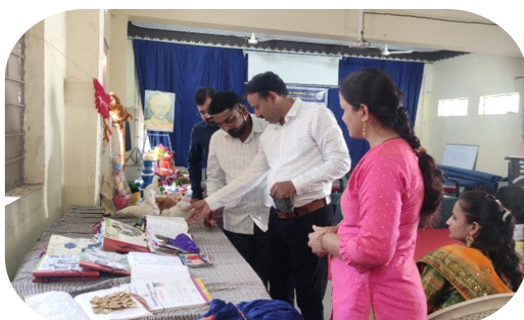
Exhibition of Articals made by trainee of CDTP Scheme