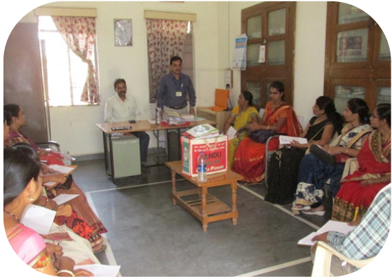
Monthly Review meeting With Trainers