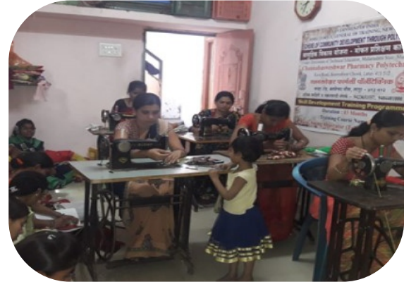
Basic Sewing Operator Training Program at Coil Nagar , Latur