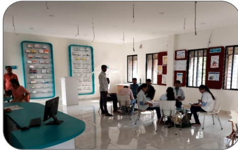
Students Performing Patient Counselling at new Model Pharmacy