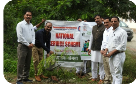
Tree Plantation by NSS Unit